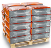
Polyethylene valve bags, 20 bags per pallet.